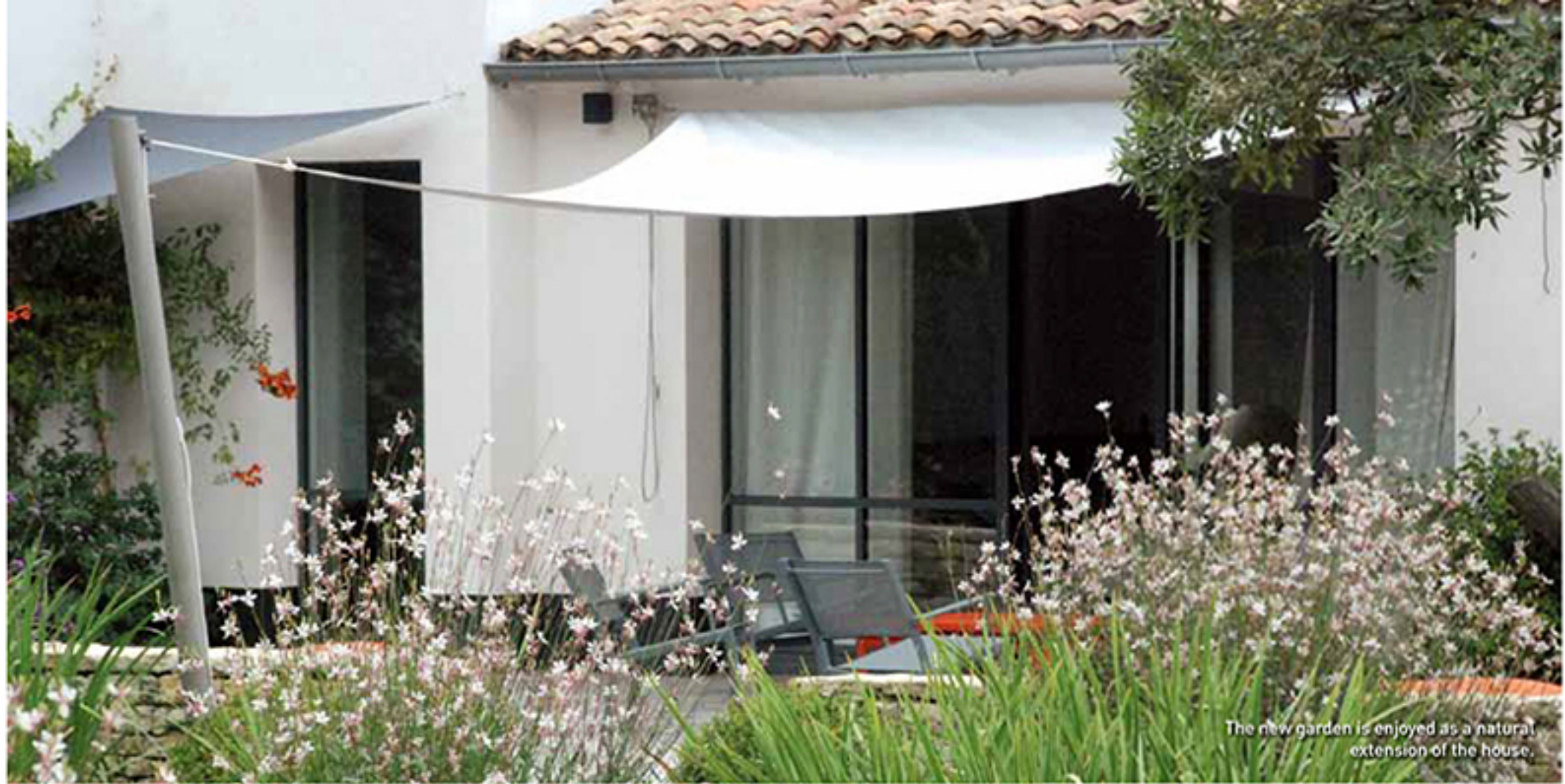
The new garden is enjoyed as a natural extension of the house.