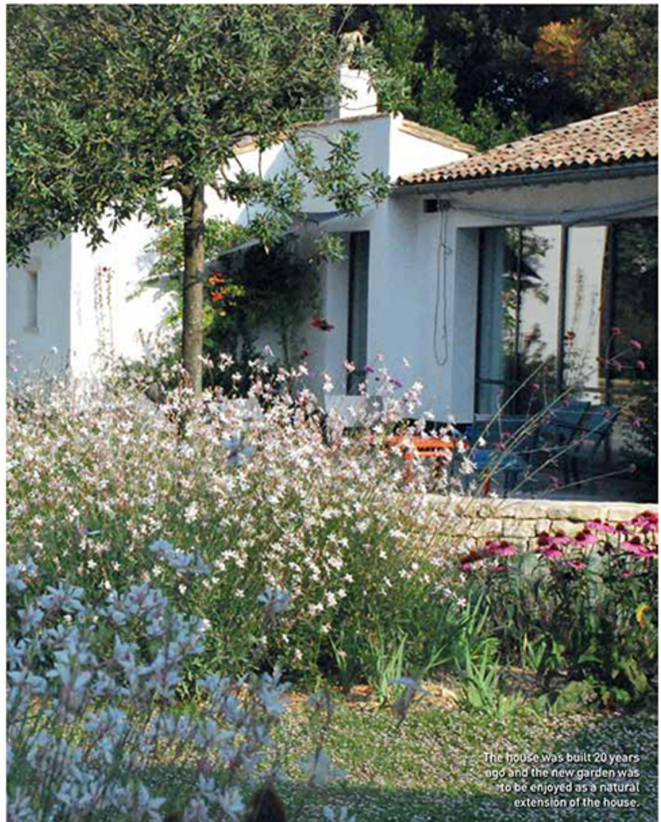
The house was built 20 years ago and the new garden was to be enjoyed as a natural extension of the house.