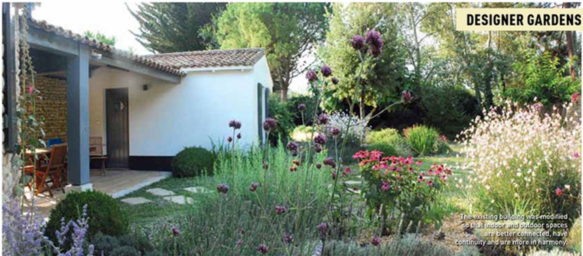
The existing building was modified so that indoor and outdoor spaces are better connected, have continuity and are more in harmony.