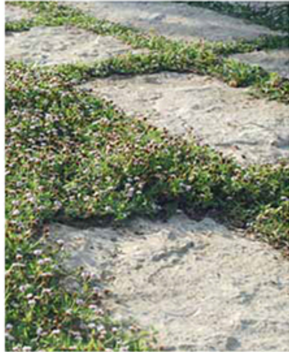
BELOW The paving used among the Phyla nodiflora groundcover is a strong local limestone.

WORDS: DANIELLE TOWNSEND