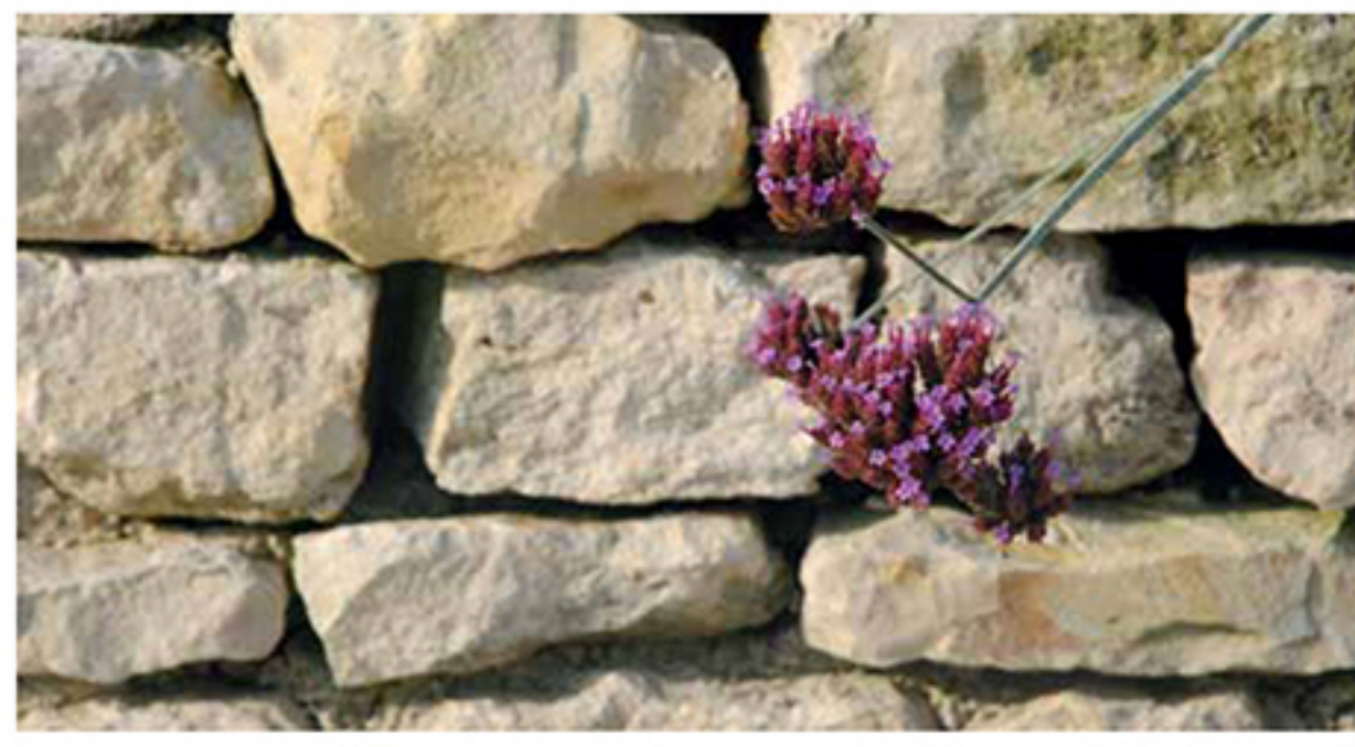
TOP LEFT AND BELOW The walls around the terraces were built with the same local limestone used for the house walls and paving.