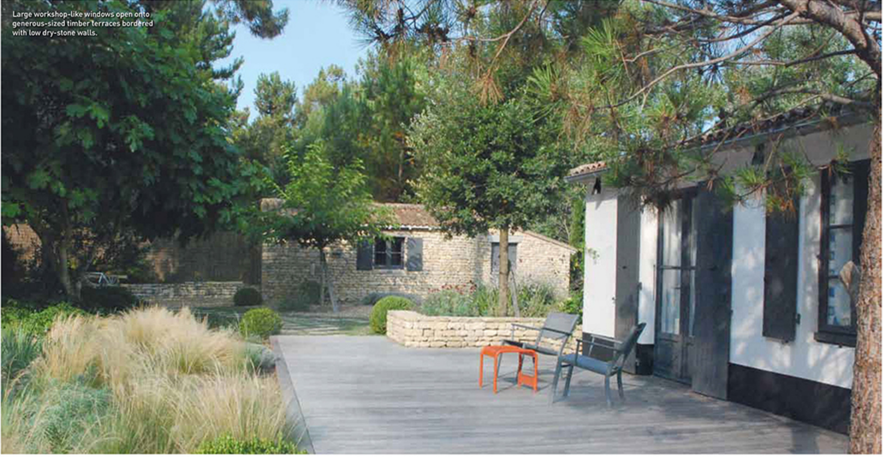
Large workshop-like windows open onto generous-sized timber terraces bordered with low dry-stone walls.

"The idea was to double the impression of available living space by creating the same